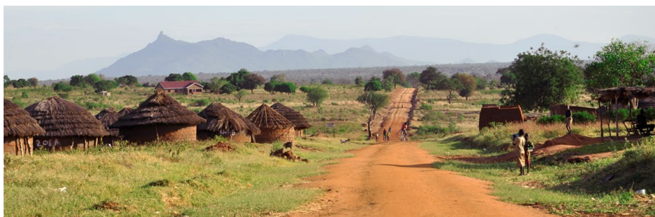
Village in North Uganda