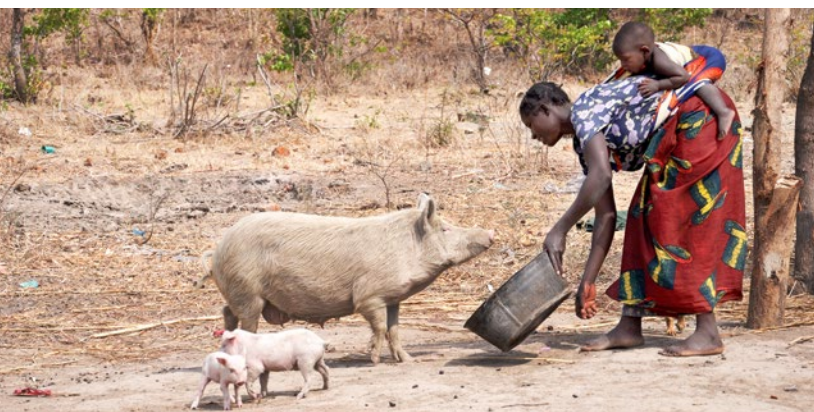
Free-roaming pig husbandry practices in the Southern province of Zambia